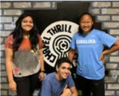
Chapel Thrill Escapes

Chapel Thrill Escapes was created by students, for students. Located in Cobb, the current room is called "Ramses in Wonderland" and is filled to the brim with mysteries and magical puzzles. Bring your roommates, suitemates, and friends and see if you have what it takes to escape Wonderland!