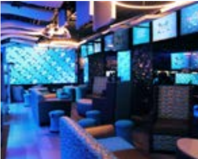
Carolina Gaming Arena

The gaming arena in Craige may be the most fun spot on campus! With 33 high-end PC stations and over 10 gaming consoles, including VR systems, the arena is set up for everything from casual (or not so casual) sessions of Mario Kart to a competitive Overwatch match with the Esports team. Gaming assistants stay ready to help you with anything you need, no matter your level of experience!