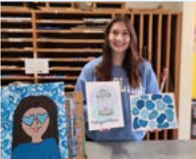
Morrison Arts Studio

The Morrison Art Studio provides students with an opportunity to unleash their inner artist! The studio features free use of all the supplies you'll need for painting and drawing and an MFA artist-in-residence who serves as a resource. A quick orientation gives all UNC students the freedom to learn, explore, and create anything they can imagine.