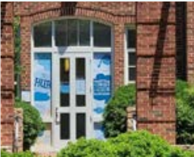
Hardin Advisory Hub

The Hardin Hub for Career & Academic Advising is a full-service extension of University Career Services and Academic Advising Program where students can meet with an academic advisor to review career and academic plans to achieve their goals, explore majors/minors and discuss course planning, and navigate academic challenges.