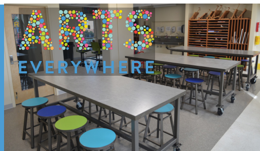
*Arts Everywhere Morrison Art Studio - Morrison Residence Hall