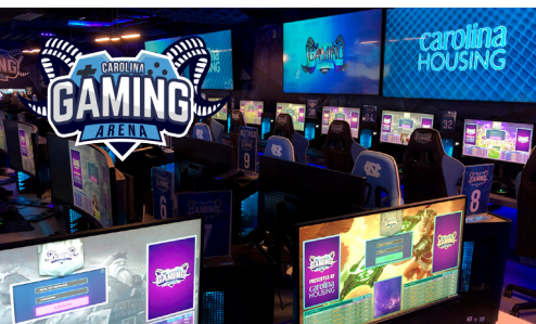
*Carolina Gaming Arena - Craige Residence Hall