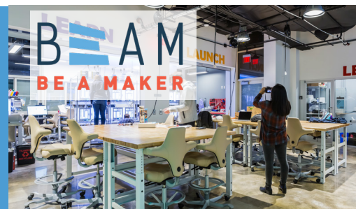
*BeAM Carmichael Markerspace - Carmichael Residence Hall