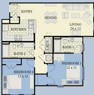
2 BEDROOM, 2 BATH Taylor: 1,050 sq. ft. Rosemary: 1,060 sq. ft.