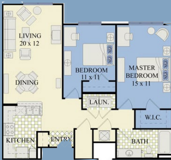
2 BEDROOM, 1 BATH Dean: 918 sq. ft. Carson: 954 sq. ft.