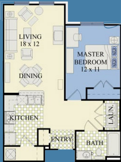
1 BEDROOM, 1 BATH Franklin: 724 sq. ft. James: 768 sq. ft.

Make your whole family part of the Carolina community!