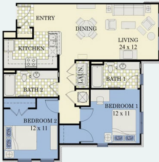
2 BEDROOM, 2 BATH Rosemary: 1,060 sq. ft.